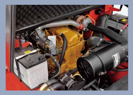
A new engine meeting the China Stage III emission standards is used, which is energy-saving and environmentally friendly and has stable performance and strong power