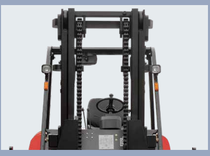
The new wide-view mast enables an excellent view and faster and safer operations