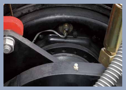
A drum brake is used, which is safer, more reliable, and easy to maintain