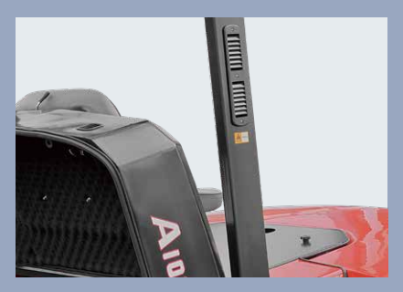
The engine's air intake pipe is provided as an independent channel in a high position to effectively prevent dust from being sucked in