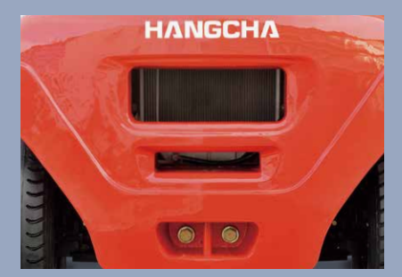
Enlarged heat dissipation channels and doublechannel vents are used to ensure normal water and oil temperature. An independent hydraulic oil heat dissipater is provided, which meets the requirements of harsh operating conditions